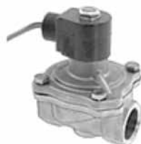
AUTOMATIC SHUTOFF VALVES