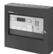
FIRE ALARM PANELS